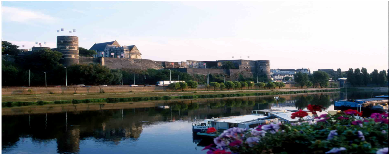
The château of Angers

Going to study in Angers? This guide will help facilitate your arrival in Angers and make your stay as enjoyable as possible.